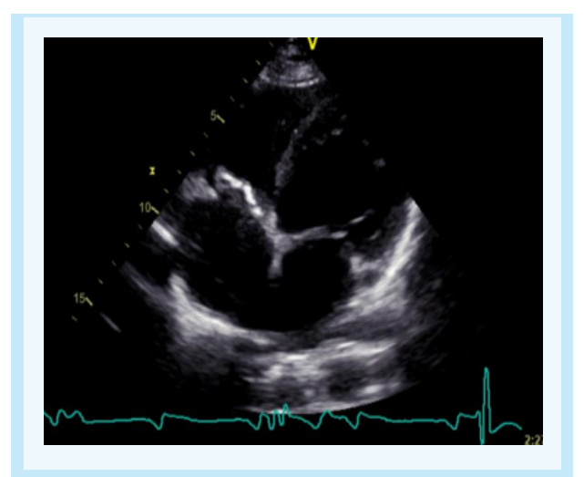
Figure 1: 2D echocardiography in the apical 4 chambers view showing thickened leaflets of the bioprosthetic tricuspid valve.

Doppler velocity index was 6.5 confirming the stenosis. Severe Tricuspid regurgitation (TR) was also noted. The size and function of the left ventricle were normal, but the right ventricle and the right atrium were enlarged (Figure 3A and B). The aortic, mitral, and pulmonic valves appeared to be normal. Transesophageal echocardiography confirmed the diagnostic of bioprosthetic degeneration.