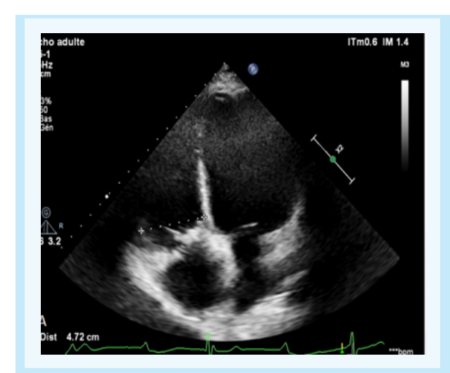
Figure 3: 2D echocardiography in the apical 4 chambers view showing dilated right cavities.

Cardiac computed tomography scan showed thickening and calcification of the 3 leaflets of the tricuspid valve with failure to open of the septal and anterior leaflets. No vegetation, no thrombus and no pulmonary embolism were diagnosed. PM telemetry was not possible, we proceeded therefore to changing the PM pocket. A second telemetry revealed failure to output. A test with 10V showed intermittent stimulation. Fibrosis around the epicardial lead was suspected.